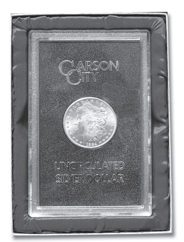
An 1884-CC dollar inside special Governors' Conference GSA box.

The GSA hard pack, housing the 1884-CC dollar, is nested in the typical indentation in the box, only it has a sheet of satin. The coin and certificate of authenticity are in the usual Mint condition. I