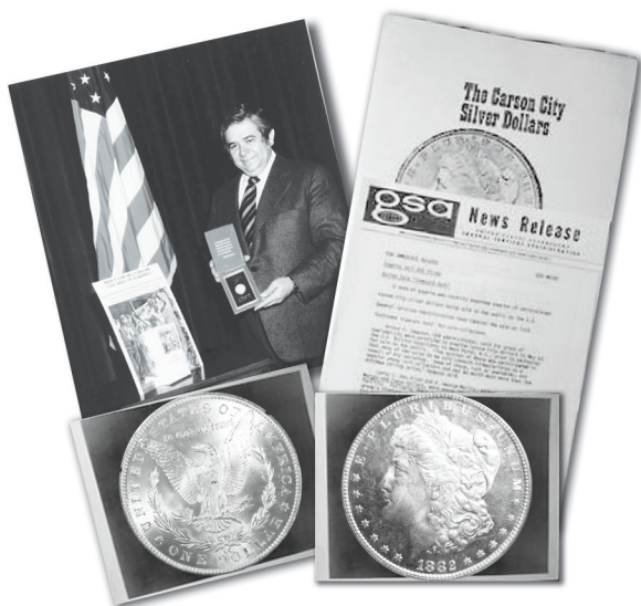
GSA press kit materials from 1974. GSA Administrator Arthur F. Sampson, at top left, holding a "CC" dollar.

In February 2010, a press kit from the General Services Administration's (GSA) Carson City silver dollar sales was sold on eBay. Press kits are compositions of pictures and printed material intended to provide the press (newspapers, magazines, etc.) with camera- or layout-ready materials that promote special events. In 1974, general interest in the GSA's sales of the U.S. Treasury's hoard of Carson City-minted silver dollars had been flagging because of market saturation. There had been four prior sales from the hoard of 2.9 million Morgan dollars and prospects for selling all of the "common" dates of 1882, 1883, and 1884 were growing dim. In the spring of 1974, the GSA issued the press kit described in this article in an attempt to boost public interest for its "Last of a Legacy" sale of 1974.